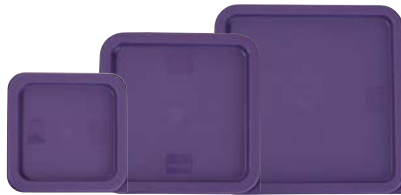
PECC-24P, PECC-68P, PECC-128P